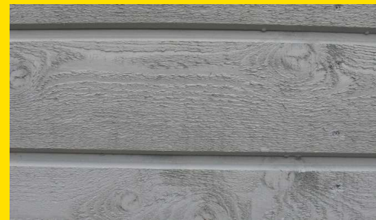
Sawn, primed, painted timber.